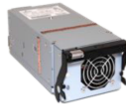
Arista 7500 Series Power Supply

The 7500E series switches are equipped with four 2900W AC power supplies. The power supplies are 2+2 grid redundant and hot-swappable. The power supplies are gold climate saver rated and have an efficiency of over 90% with single stage conversion to the internal 12V DC voltage.