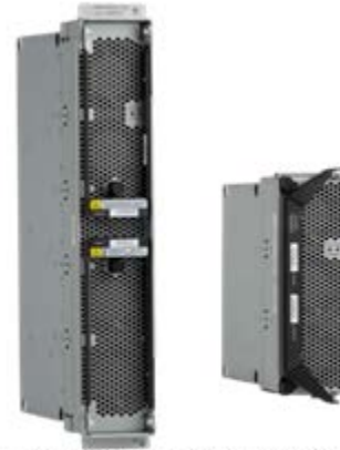
Arista 7500 Series Fabric Modules

At the heart of the 7500E series is the fabric. It interconnects all line cards in a non-blocking architecture irrespective of the traffic pattern providing a full 5.12 Tbps per fabric module. Each line card module connects to the fabric with multiple links and data packets are spread across the links to fully utilize the fabric capacity. Unlike hash-based selection of fabric links, the 7500E architecture provides 100% efficient connectivity from any port to any other port with no drops. The fabric modules are always active-active, provide N+1 redundancy and can be hot-swapped with zero performance degradation. The Fabric Modules for the 7508E and the 7504E are different based on the size of the chassis and both integrate a fan assembly for flexible and redundant cooling.