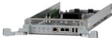
Arista 7500 Series Supervisor

The supervisor modules for the 7500 series run Arista Extensible Operating System (EOS) and handle all control plane and management functions of the system. One supervisor module is needed to run the system and a second can be added for stateful 1+1 redundancy. Each supervisor module takes up only a half slot resulting in very efficient use of space and a higher density design. The quad-core x86 CPU with 16GB of DRAM and an optional SSD provides the control plane performance needed to run an advanced data center switch scaling to over 1,000 physical ports and thousands of virtual ports. A pulse per second clock input port enables synchronizing with an external source to improve the accuracy of monitoring tools.