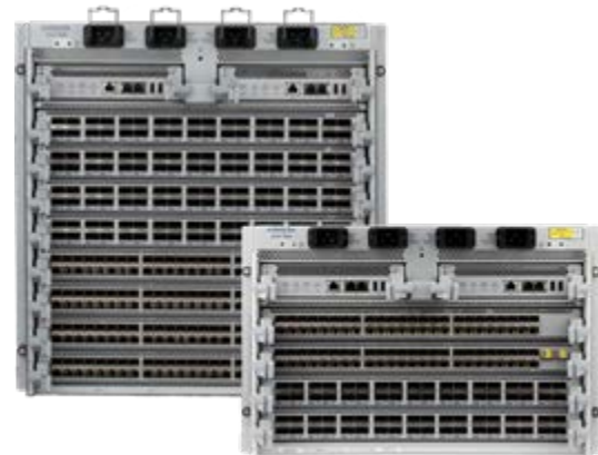
Arista 7500 Series Chassis

The 7500 chassis provides room for two supervisor modules, four or eight line card modules, four power supply modules, and six fabric modules. The 7504 chassis fits into 7 rack units while the 7508 chassis fits into 11U of a standard data center rack. Supervisor and line card modules plug in from the front, while the fabric and power supply modules are inserted from the rear. The midplane is completely passive and provides control plane connectivity to each of the fabric and line card modules. The system design is optimized for data center deployments with front- to-rear airflow.